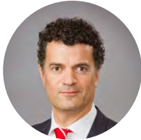
Jared Blumenfeld Council Member Secretary of the California Environmental Protection Agency