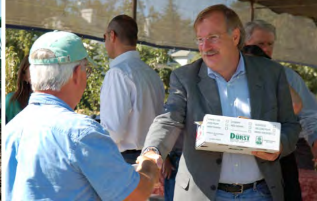
Government\ representatives\ learn\ about\ opportunities\ to\ bolster\ the\ region's\ ag\ economy\ on\ 2008\ RUCS'\ farm\ tours.\ Source:\ SACOG\ Staff