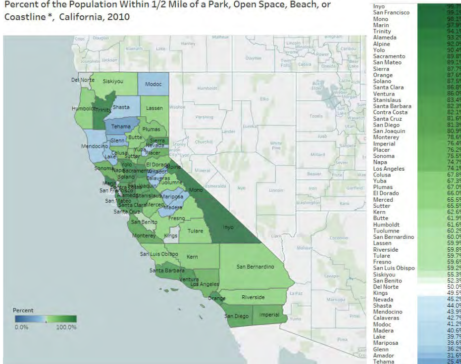
Figure 4: Parks greater than 1 acre with “Open Access” designation, by county, Data source: CALANDS (2016), U.S. Census Bureau (2010), Analysis by Healthy Communities Data and Indicators Project (HCI), CDPH.